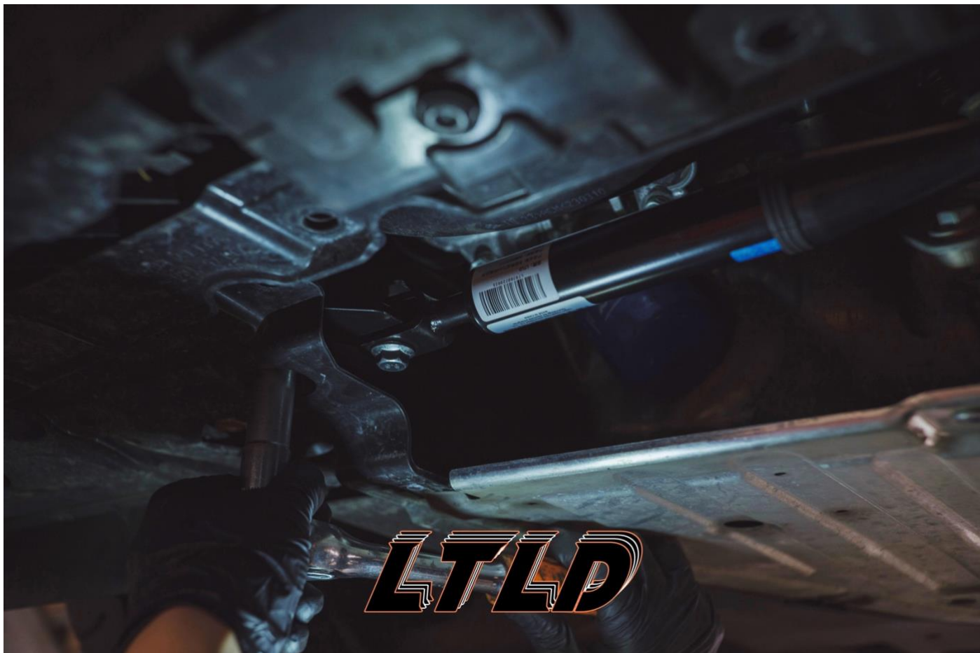
① Front performance damper: The guard plate must be removed for installation. It is installed under the water tank.